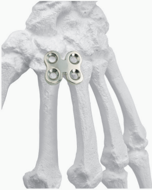
2.0 mm. Mini Straight Plate 2.0 mm. Mini Düz Plak