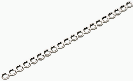
2.0 mm. Mini Adaptation Plate 2.0 mm. Mini Adaptasyon Plak