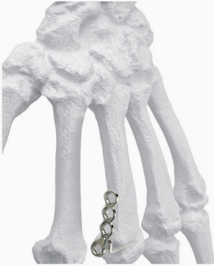
2.7 mm. Multi Fragment Plate 2.7 mm. Çoklu Kırık Plak