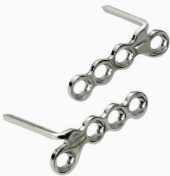
2.0 mm. Mini Condylar Plate 2.0 mm. Mini Kondilar Plak