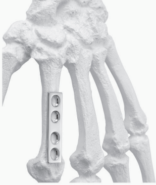
2.0 mm. Mini Straight Plate (with radius) 2.0 mm. Mini Düz Plak (radyuslu)