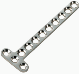
2.0 mm. Mini T-Plate 2.0 mm. Mini T-Plak