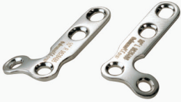
90° Mini L-Plate 90° Mini L-Plak

Screw to be used : Fixation with \varnothing 2.0 mm. mini cortical screws Plate thickness : 1.0 mm. Plate width : 5.0 mm. Hole spacing : 6.0 mm.