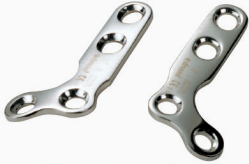
110° Mini L-Plate 110° Mini L-Plak