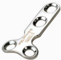
Mini T-Plate Mini T-Plak